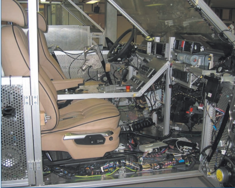
Figure 1. A traditional breadboard.

cle wiring harness are available. (Typically, the wiring harness is the last item to be delivered—perhaps only two weeks before building of the prototype vehicles begins.) Second, testing must be performed manually using the actual switches, sensors, and actuators. Third, it is difficult to test system response under failure conditions, such as a blown fuse or wiring short circuit, as the engineer must physically introduce the fault. Finally, breadboard testing can cover only static vehicle conditions, making it